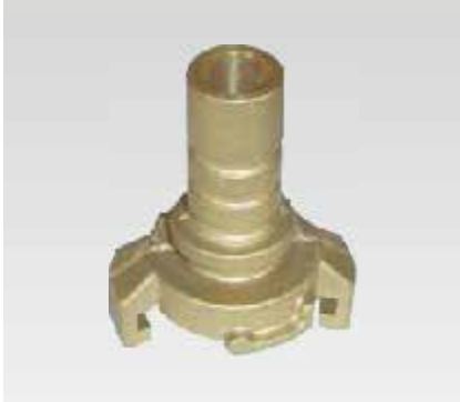
Universal Hose end