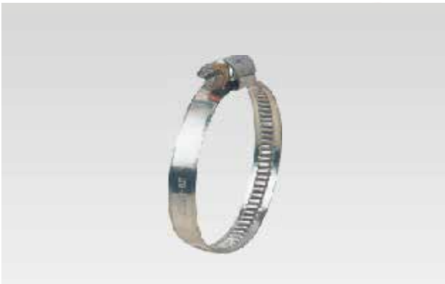
Germany Type clamp (Band width: 9mm and 12.7mm)