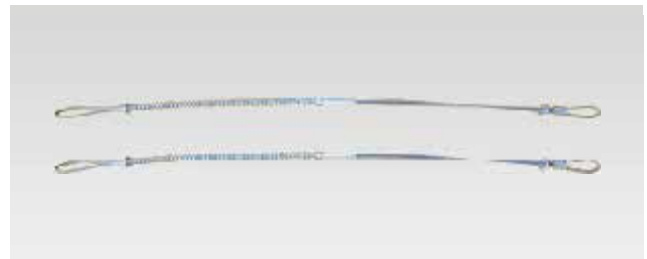
HOSE TO HOSE