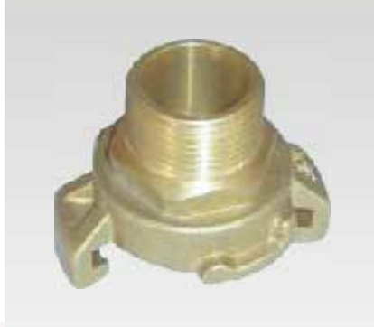
Universal Male end