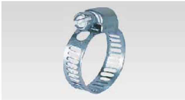
American worm-drive clamp (Band width: 8mm and 12.7mm)