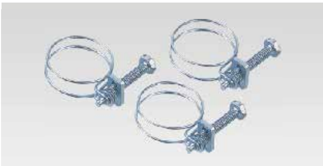
Double-wire hose clamp